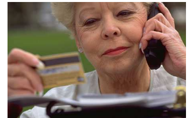
Consumer Education programs help individuals and families prevent and cope with identity theft, frauds, and scams.

Who Gets Grandmother's Yellow Pie Plate: Transferring non-titled personal property can be a difficult issue for families. Participants will discover the meaning of objects, determine what is fair when deciding who gets what, and learn about the many distribution options that are available. (1 to 1 1/2 hours)