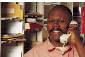
Homebased and Microbusiness Education programs help individuals and families profit from home and small businesses.

Your Family Disaster Plan: Emergency preparedness is on everyone's mind these days. This interactive workshop will show you how to prepare a family disaster plan, what to include in a disaster supplies kit, how to plan for family communication, and steps to take in the event of a disaster. (1 1/2 hours)