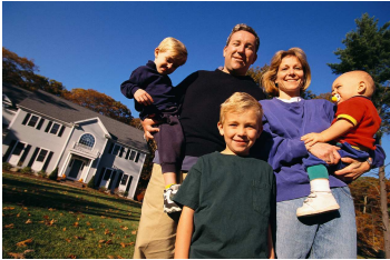
Home and Housing Education programs help families keep their home environments healthy.

Getting Out of Debt: Participants in this program will learn how to develop a spending plan and a debt repayment plan, ways they can work with creditors effectively, and strategies they can use to reduce debt and improve financial health. (1 1/2 hours)