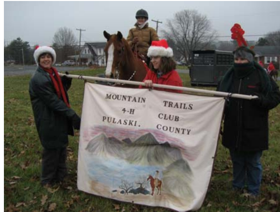
Mountain Trails 4-H Horse Club Members and Adults getting ready for the Dublin Christmas Parade.