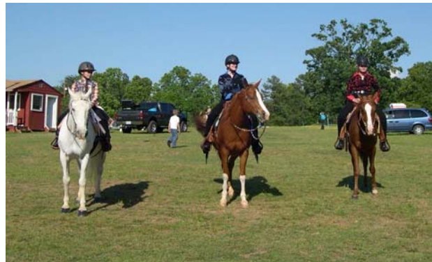
Mountain Trails 4-H'ers at Rustburg Show