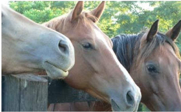
Just hanging out with my horse friends.